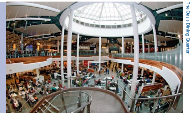
The Oasis Dining Quarter

2008 David McKnight moves to group board