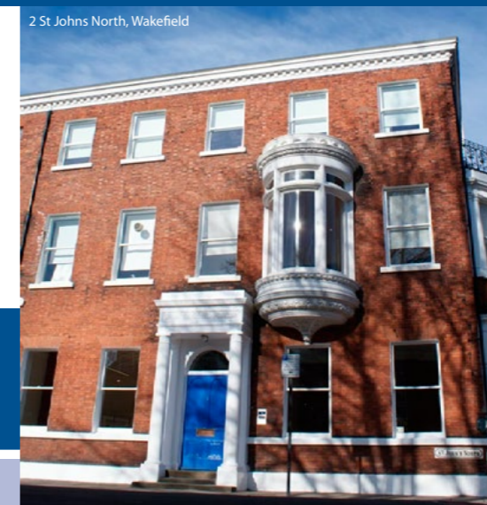
2 St Johns North, Wakefield