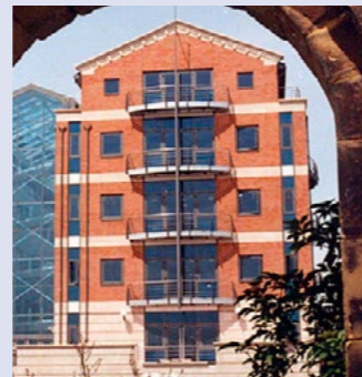
Addleshaw Goddard Offices, Leeds

1997 First central Leeds office building completed for Addleshaws