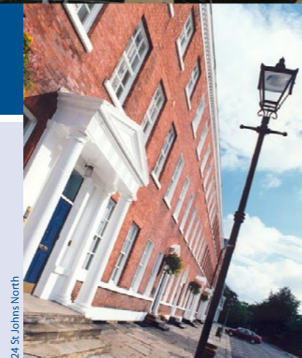
24 St. Johns North