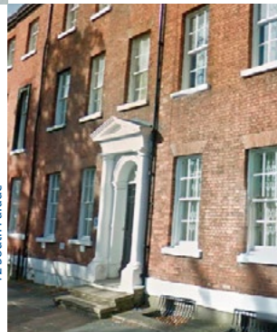
12 South Parade

1984 Our first completed building was B&Q Barrow in Furness for Commercial Development Projects Ltd